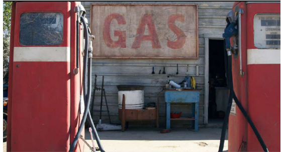
THIS CLASSIC TEACHING ORIGINALLY APPEARED IN MAY 1990. | BY KENNETH COPELAND